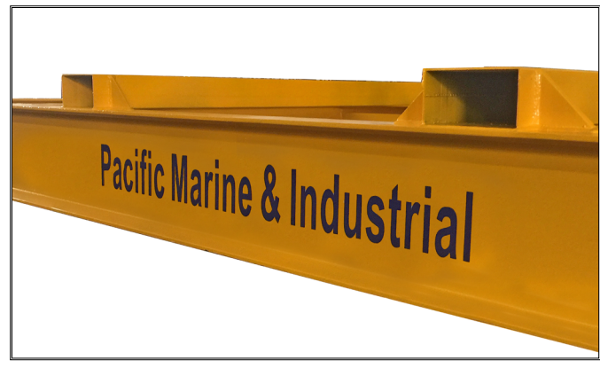
PM&I Side Mark