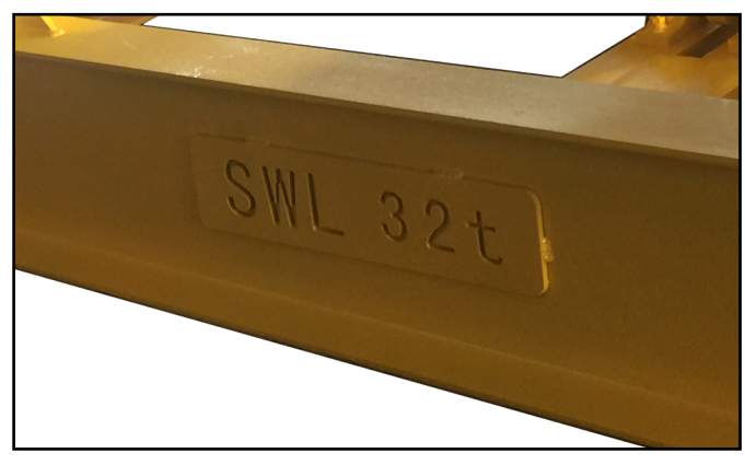
SWL Side Mark