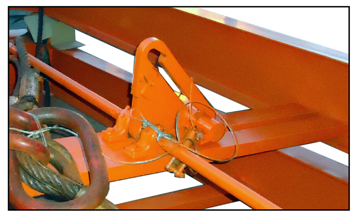
Automatic Operation Mechanism