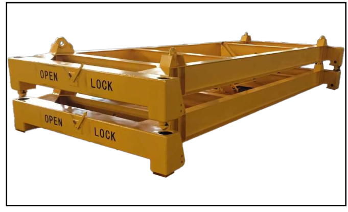
Auto Open and Locked Indicator