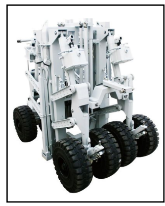
Hydraulic Self Lifting Container Dolly