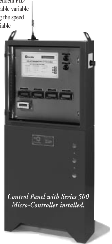
Control Panel with Series 500 Micro-Controller installed.

The Series 500 is not limited to these applications. It is designed to accommodate the most demanding automation needs. The Series 500 is applicable in situations requiring many inputs and/or outputs and where very precise set points and timing periods are required. It is especially useful when easy customer interface is desirable.